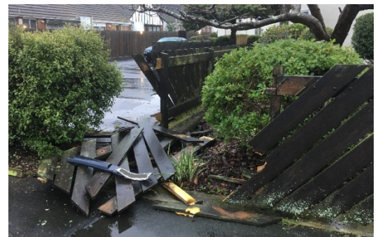
Sacred Heart NEV: Demolished Fence & Vehicle License Plate