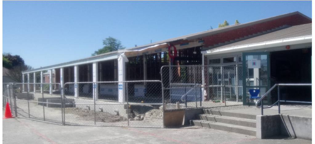
St Thomas's, Winton: Main Block

The contractor, Jones & Cooper Ltd, are well advanced with the main block classroom extension and reconfiguration work at St Thomas's Winton. The verandah extension is largely complete. New double-glazed windows and doors will be fitted next.