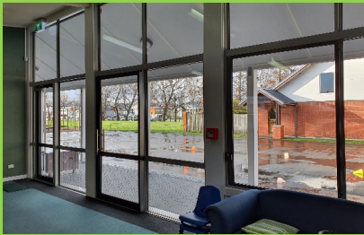
St Joseph's School Balclutha: Block B