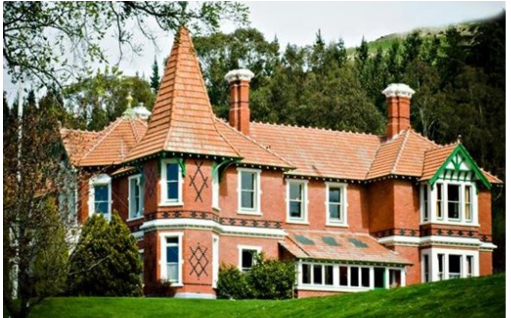
Redcastle, St Kevin's College, Oamaru

Recent high winds caused tiles to dislodge and fall from the corner tower at Redcastle, St Kevin College, Oamaru. Immediate health and safety protocols were put in place to ensure site safety and whilst a temporary roof repair is in place the Property Group is working with the College to provide a permanent fix to the apparent deterioration of the original French made clay tiles.